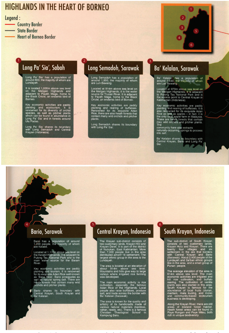
Figs. 2 and 3. The opening English-language maps in Highland Tales , marking key regions of Borneo and their Indigenous populations.

marize their primary economic activities, and describe shared borders. These small details, cataloged in square boxes across the base of the map, assert the presence and vitality of Orang Ulu communities in Borneo.