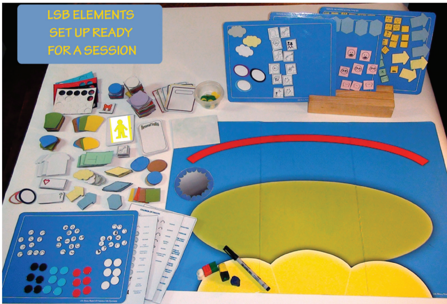
Figure 3 Revised Life Story Board kit (post-pilot study)

The study provided valuable information on how to improve the tool itself, the process of its use, and the training of users. Based on participants' feedback on the prototype, there has been considerable revision of the LSB kit: the LSB board was reduced in size by 60% and the cards magnetized, with "palettes" for easier display and handling (Figure 3). The training workshop and instructional resources better consider the learning curve to become familiar with the LSB system before clinical use.