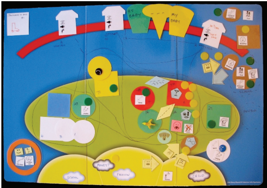
Photo of a Life Story Board Lifescape