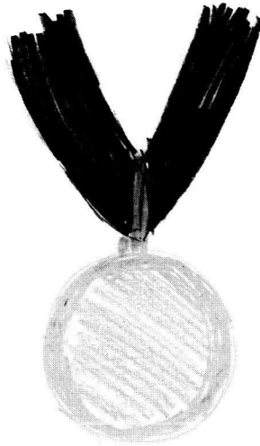
Figure 3. My Badges

I wanted to pretend it all wasn't happening — to forget it all, but I couldn't — the little purple box kept me in."